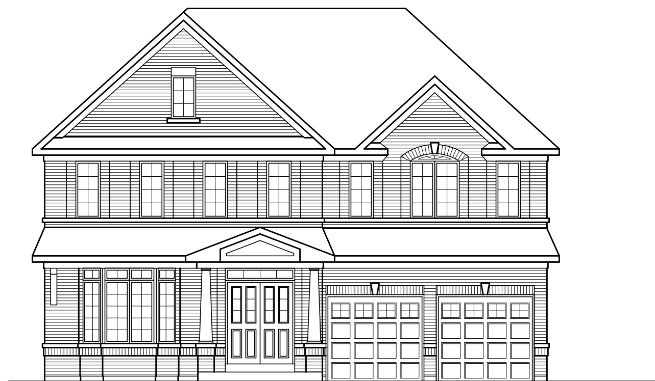
FRONT ELEVATION 'B'